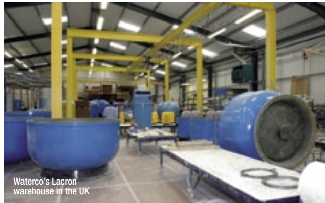
Waterco's Lacron warehouse in the UK

successful than the residential sector. This year, on Hainan Island, a resort close to Hong Kong, holiday villas were built – each with a swimming pool – and they had a starting price $USD1.5 million. The developers were willing to pay more for swimming pool equipment which they felt was more reliable. Our sales growth was a result of selling equipment into this market.”