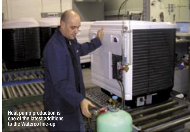
Heat pump production is one of the latest additions to the Waterco line-up

“After the GFC, we have seen market changes in China where customers are now willing to pay more for quality products that are more durable. In the past, our presence had been mainly in the commercial sector where we were competing with locally made fibreglass filters and corrosion lined steel tanks. This is an area we have been more