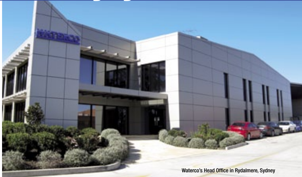
Waterco's Head Office in Rydalmere, Sydney